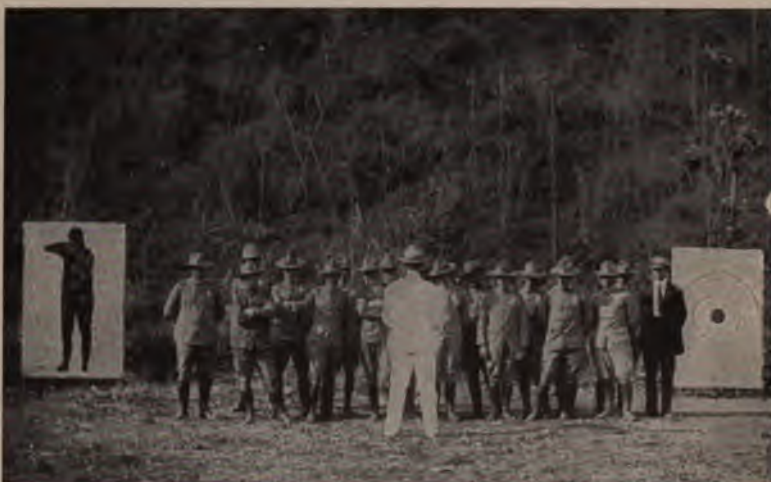
"The Chief" addresses the "crack shots" at the target range